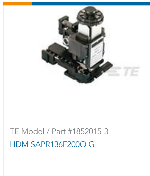
TE Model / Part #1852015-3 HDM SAPR136F2000 G