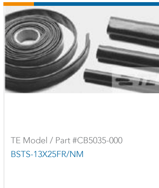
TE Model / Part #CB5035-000 BSTS-13X25FR/NM