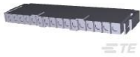
TE Model / Part #207542-1 HSG,PLUG 16 POSN,METRIMATE