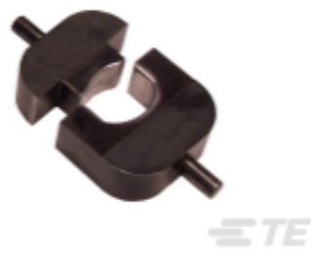
TE Model / Part # 46753-2 HYP8 AMPOWER 350MCM DIE SET