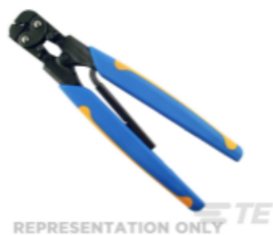
TE Model / Part #68262-1 DAHT SOLIS FLAG 14-10