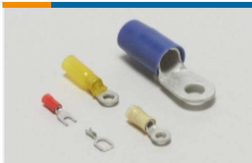
Rings & Spades(140)