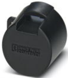
Protective cap for 3 and 5-pos. PRC device plugs

Please be informed that the data shown in this PDF Document is generated from our Online Catalog. Please find the complete data in the user's documentation. Our General Terms of Use for Downloads are valid ( http://phoenixcontact.com/download )