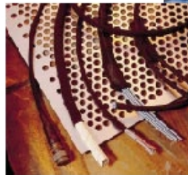
Heat-shrinkable materials grip substrates without additional fixing.