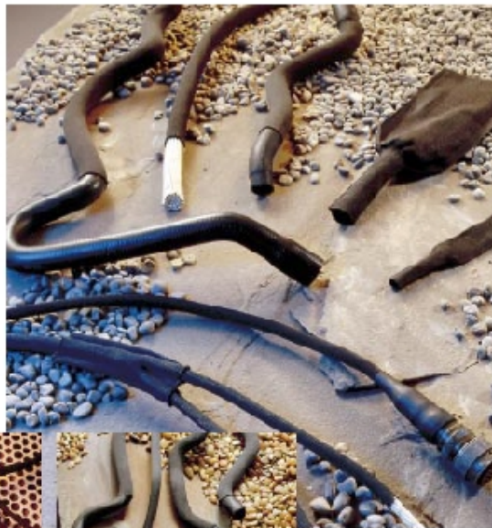
Woven fabric tubing with 2:1 shrink ratio for easy installation.

extremely flexible and resistant to trapping water, heat and humidity. It provides outstanding abrasion, chafing and cutting protection, even at high temperatures. HFT5000 product is easy to install and can be cut with standard industrial cutting equipment.