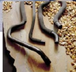
Highly flexible woven construction allows easy, compliant installation onto awkward substrates such as bent hoses.