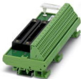
VARIOFACE interface module with spring-cage connection, for Yokogawa RTD module AAR145.

Please be informed that the data shown in this PDF Document is generated from our Online Catalog. Please find the complete data in the user's documentation. Our General Terms of Use for Downloads are valid ( http://phoenixcontact.com/download )