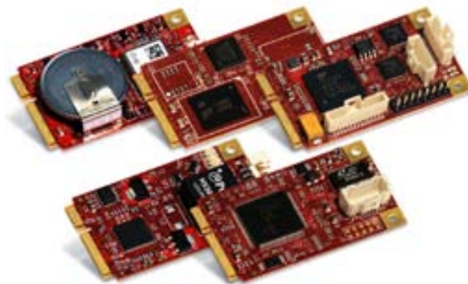
Mini PCIe Modules