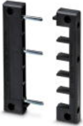
Sealing frame, Length: 147 mm, Width: 58 mm, Height: 17 mm, Color: black

Please be informed that the data shown in this PDF Document is generated from our Online Catalog. Please find the complete data in the user's documentation. Our General Terms of Use for Downloads are valid ( http://phoenixcontact.com/download )