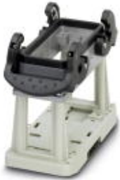
HEAVYCON connector assembly frame with panel mounting base with double locking latch, for contact inserts of type B10

Please be informed that the data shown in this PDF Document is generated from our Online Catalog. Please find the complete data in the user's documentation. Our General Terms of Use for Downloads are valid ( http://phoenixcontact.com/download )