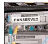
Network Infrastructure Labeling