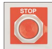
Raised Panel Labels