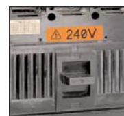
Electrical Hazard Labels