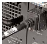
Electrical Infrastructure Labeling