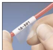
Wire and Cable Marking