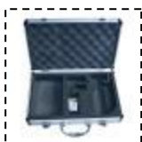
Metal Case (optional)