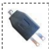
5V, 1KHz Output