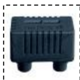
Capacitance Ext Module