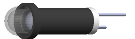
ISOMETRIC VIEW ONLY FOR REF.