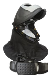
APF 1000 L-905 with Adflo