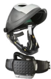
APF 25 L-705 with Adflo