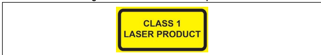
Figure 1. Label for Class 1 laser products

The VL53L0X contains a laser emitter and corresponding drive circuitry. The laser output is designed to remain within Class 1 laser safety limits under all reasonably foreseeable conditions including single faults, in compliance with IEC 60825-1:2014 (third edition). The laser output will remain within Class 1 limits as long as STMicroelectronics recommended device settings are used and the operating conditions, specified in the STM32L4 Series datasheets, are respected. The laser output power must not be increased by any means and no optics should be used with the intention of focusing the laser beam. Figure 1 shows the warning label for Class 1 laser products.