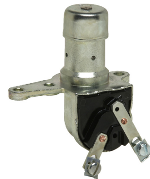
Foot-operated Turn Switch