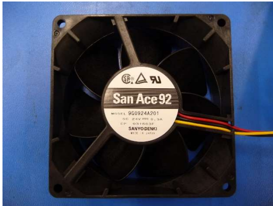
Reference model: 9G0924A201

Due to the heavy weight construction of the impeller top, a brown compound may be added for rotor balancing purposes as shown below.