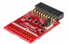
CryptoAuth Xplained Pro