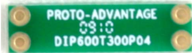
2D Top View (Pins Unassembled)