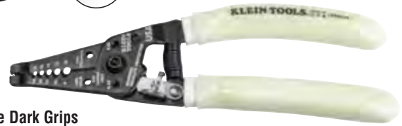
Glow in the Dark Grips