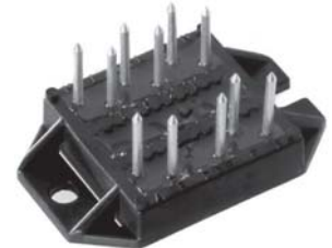
Pin arrangement see outlines