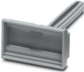
Terminal strip markers, gray, Unlabeled, Mounting type: Plug in, Lettering field: 20 mm x 8 mm

Please be informed that the data shown in this PDF Document is generated from our Online Catalog. Please find the complete data in the user's documentation. Our General Terms of Use for Downloads are valid ( http://download.phoenixcontact.com )