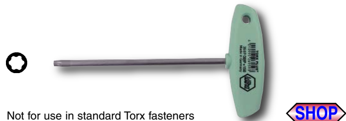
Not for use in standard Torx fasteners

364 TORXPlus® Screwdriver, With Wiha-T-handle Blade high alloy chrome-vanadium-molybdenum steel, hardened, hard chromed. Wiha-T-handle high quality plastic, impact resistant.