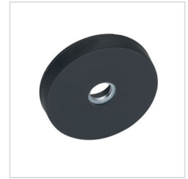
View of magnetic surface