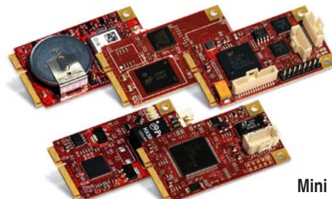
Mini PCIe Modules