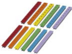
The illustration shows various versions of the article

Please be informed that the data shown in this PDF Document is generated from our Online Catalog. Please find the complete data in the user's documentation. Our General Terms of Use for Downloads are valid ( http://phoenixcontact.com/download )