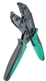
300-054 Lunar Crimp Frame