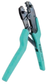
300-096 Ergo-Lunar Crimp Frame