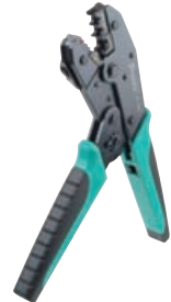
CP-3005F Quick Interchange Ratcheting Crimper Frame

Note: CP-3005F sold as frame only, but all dies on this page fit it