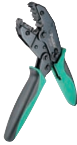
300-054 Lunar Crimp Frame