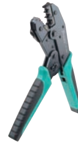
CP-3005F Quick Interchange Ratcheting Crimper Frame

Note: CP-3005F sold as frame only, but all dies on this page fit it