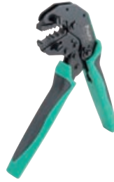
902-085 CrimPro Crimp Frame