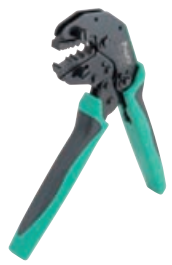
902-085 CrimPro Crimp Frame