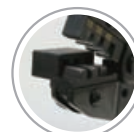
Phillips long screw that holds the locator in place