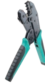
CP-3005F Quick Interchange Ratcheting Crimper Frame

Note: CP-3005F sold as frame only, but all dies on this page fit it