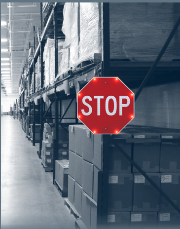
WAREHOUSE RACK MOUNT