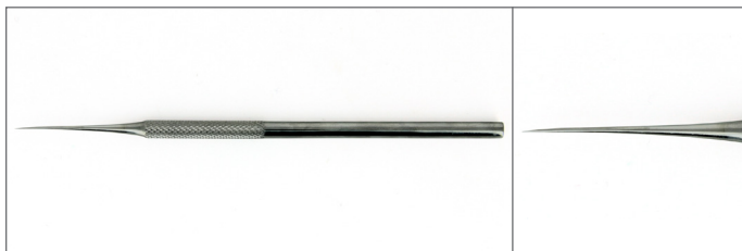
MPTSP1 Stainless steel probe - Straight needle tip