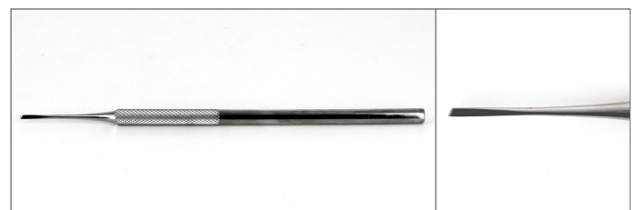
MPTSP6 Stainless steel probe - Flat tip