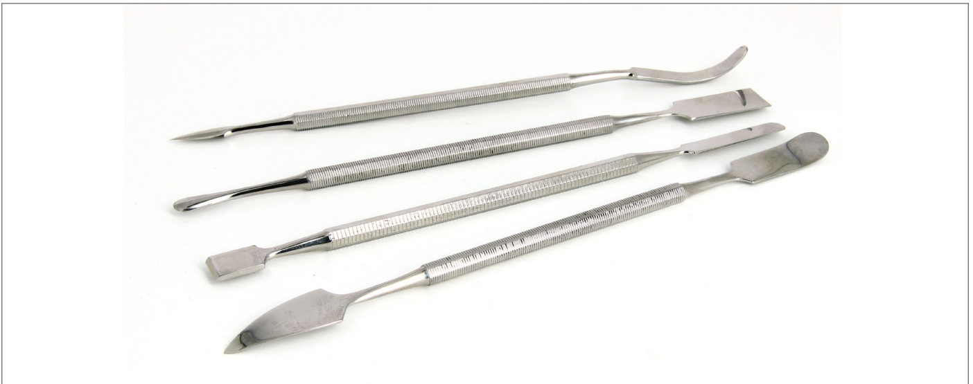
K4MPTSS Stainless steel spatulas - Kit of four styles (MPTSS1, MPTSS2, MPTSS3, MPTSS4)