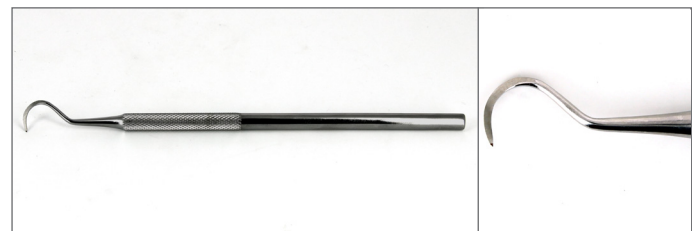
MPTSP4 Stainless steel probe - Hook tip