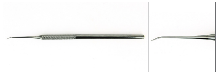
MPTSP2 Stainless steel probe - Angled needle tip