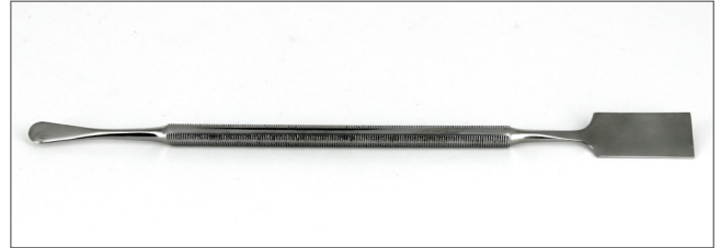
MPTSS2 Stainless steel spatula – Short rounded tip & large flat squared tip