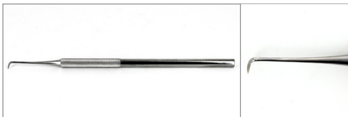
MPTSP3 Stainless steel probe - Single bend tip