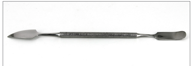
MPTSS4 Stainless steel spatula – Long curved pointed tip & long curved rounded tip