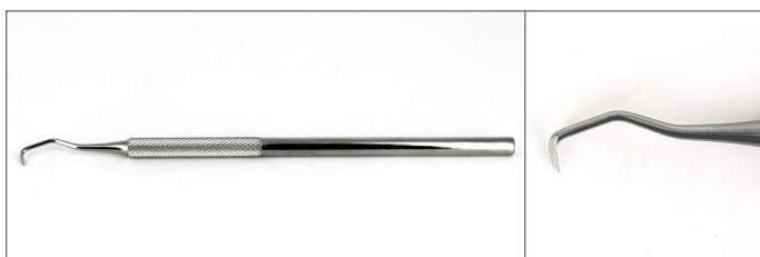
MPTSP5 Stainless steel probe - Triple bend tip