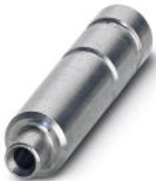
Crimp head positioner

Please be informed that the data shown in this PDF Document is generated from our Online Catalog. Please find the complete data in the user's documentation. Our General Terms of Use for Downloads are valid ( http://download.phoenixcontact.com )