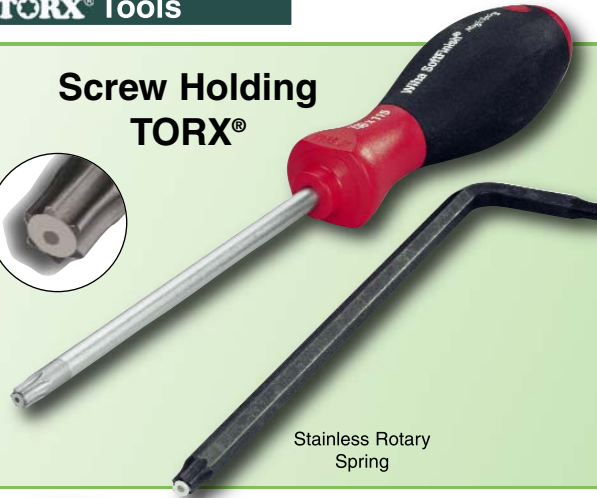
Stainless Rotary Spring