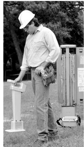
The 3M™ Dynatel™ Advanced Cable/Fault Locator 2273 can be used with the 3M™ Dynatel Marker Locating Accessory 2205/2206 EMS.

For cable path locating, the 2273 advanced cable/fault locator receiver uses one of four user-selected locating modes – dual peak, dual null, differential or special peak (which increases the sensitivity of the receiver for tracing over longer distances). The mode is selected depending on which is most effective under the locating conditions.