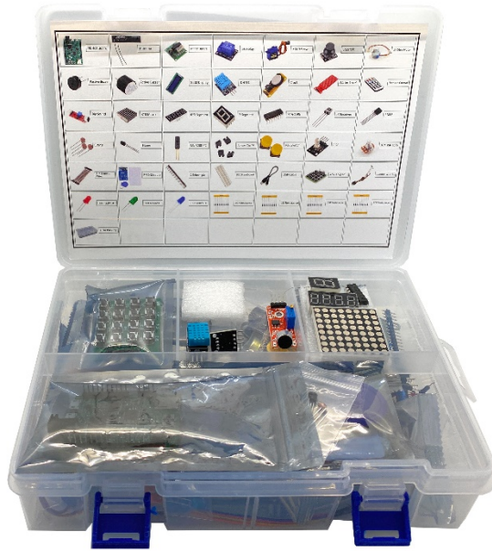
Figure 2. Firm Package for the Kit