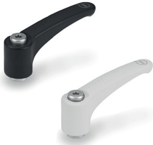
ERGOSTYLE® ELESA Original design