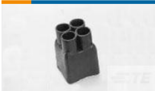
TE Part #034084-001 F133-200-FR