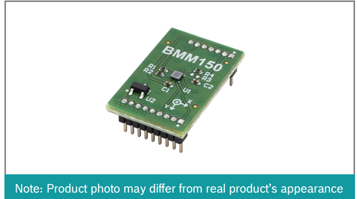
Note: Product photo may differ from real product's appearance

The Bosch Sensortec BMM150 shuttle board 3.0 is a PCB with the magnetometer BMM150 mounted on it. In combination with the application board 3.0, the shuttle board can be used to evaluate various functionalities provided on BMM150. The shuttle board allows easy access to the sensor pins via a simple socket and can be directly plugged into the Bosch Sensortec's application board 3.0.