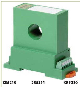
Single Element - .79" Window 0.1 to 600 ADC Input Range