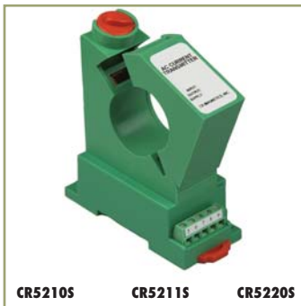
Single Element - 1.2" Window 20 to 600 ADC Input Range

The CR5200 Series, DC Current Transducers are designed to provide a DC signal which is proportional to a DC sensed current. These devices are designed for direct current only, targeting them towards general and daily applications. The ranges 2 to 10 Amp utilize an advanced Magnetic Modulator technology and the ranges 20 amps and above utilize Hall Effect technology.