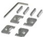
HMI mounting kit for installation on a front plate. The mounting kit includes 4 x mounting brackets, 4 x screw threads, and a hexagonal wrench.

Mounting material - HMI SCB MOUNTING KIT 4 - 2701384