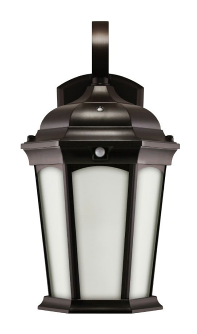
Integrated LED Fixture