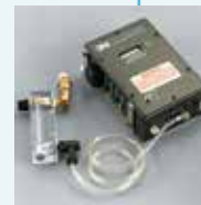
W-2808/37027 CO Monitor Retrofit Kit

IMPORTANT: These filter and regulated panel products do not produce Grade-D breathing air. The employer is required to ensure that the compressed air used with any supplied air system meets the requirements for Grade-D breathing air per the Compressed Gas Association Commodity Specification G-7.1-1997. In Canada, refer to CSA Standard Z180.1 for the quality of compressed breathing air.