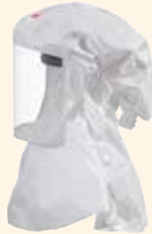
3M™ Versaflo™ Headcover S-433 Head, face, neck and shoulder coverage. Integrated suspension.