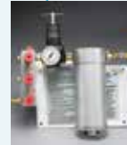
W-2806/07006 (50 cfm) without CO Monitor

IMPORTANT: These filter and regulated panel products do not produce Grade-D breathing air. The employer is required to ensure that the compressed air used with any supplied air system meets the requirements for Grade-D breathing air per the Compressed Gas Association Commodity Specification G-7.1-1997. In Canada, refer to CSA Standard Z180.1 for the quality of compressed breathing air.