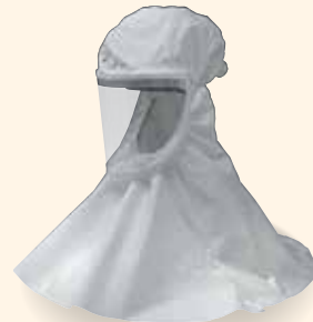
3M™ Versaflo™ Economy Hood S-403 Head, face, neck, and shoulder coverage. Fabric suspension, inner shroud.