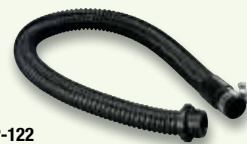
GVP-122 Breathing Tube