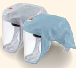
3M™ Versaflo™ Headcover S-133 and S-133B Head and face coverage. Integrated Comfort suspension. General purpose fabric.