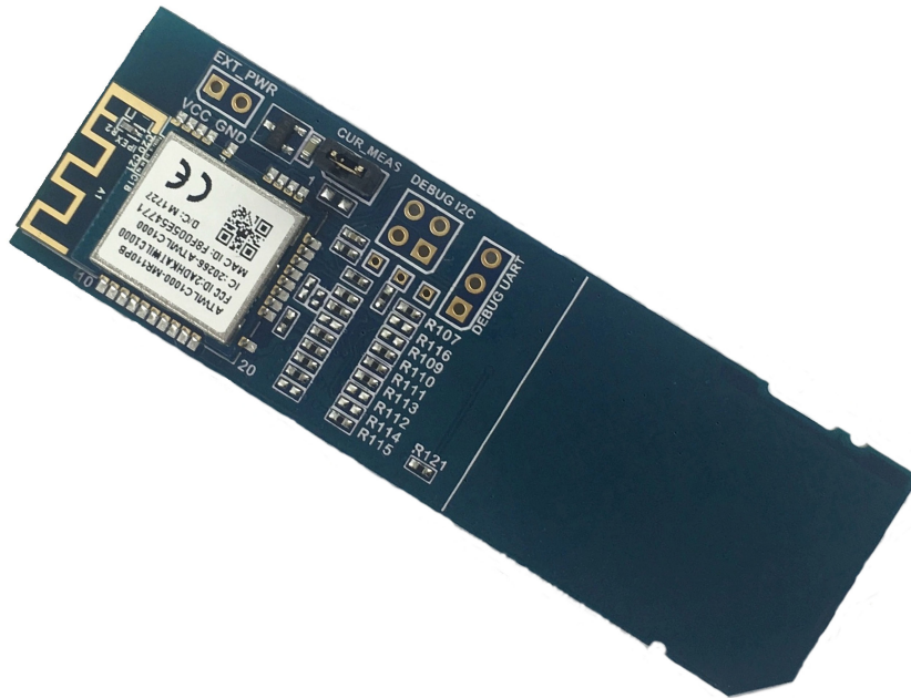
Figure 1. ATWILC1000-SD Board

The ATWILC1000-SD is a Secure Digital (SD) card interface board designed to demonstrate the features of the low power consumption ATWILC1000-MR110PB IoT (Internet of Things) module, that supports an IEEE® 802.11 b/g/n standard. This module is specifically optimized for low power IoT applications.