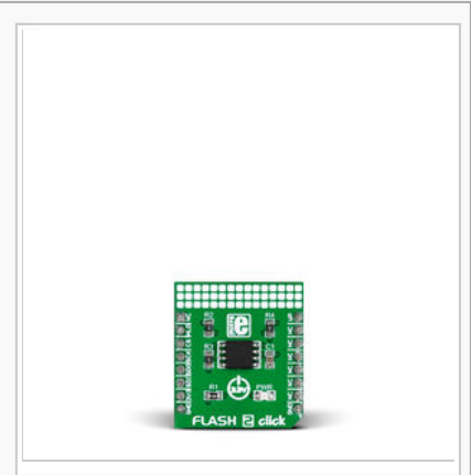
Flash 2 click