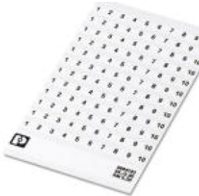
Marker cards, white, Mounting type: Adhesive, For terminal block width: 5 mm

Please be informed that the data shown in this PDF Document is generated from our Online Catalog. Please find the complete data in the user's documentation. Our General Terms of Use for Downloads are valid ( http://download.phoenixcontact.com )