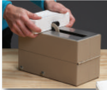
Scotch® Manual Dispenser S63 applies a neat, consistently sized L-clip of tape in a single pass of a box.

Bundle a wider range of fabrics with clean removal Scotch® Transparent Film Tape 640.