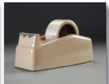
Scotch® Heavy-Duty Tabletop Dispenser C22 for pull and tear convenience.