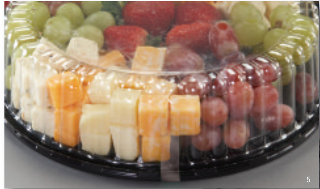
Hold plastic party tray lid with Scotch® Transparent Film Tape 605