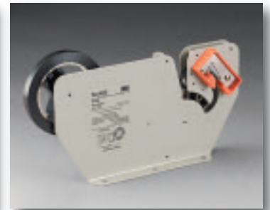
Scotch® Bag Sealer P400 applies tape in an adhesive-to-adhesive flag seal, includes bag trimmer.