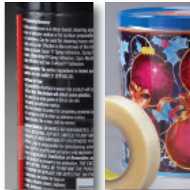
Attach applicator tube to aerosol can with Scotch® Transparent Film Tape 600.