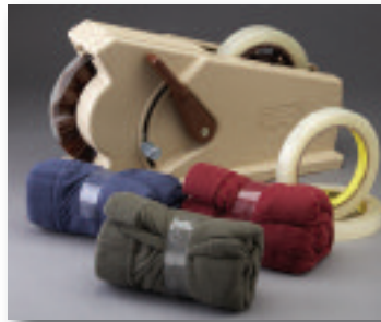
Scotch® Definite Length Dispenser M96 dispenses pre-set lengths of .75" to 5" per stroke.