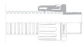
Conduit complete with FPA fitting