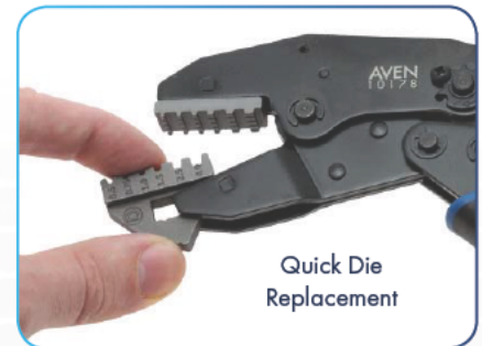
Quick Die Replacement