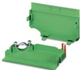
Cable housing, Pitch: 0 mm, Number of positions: 18, Dimension a: 90 mm, Color: green

Please be informed that the data shown in this PDF Document is generated from our Online Catalog. Please find the complete data in the user's documentation. Our General Terms of Use for Downloads are valid ( http://download.phoenixcontact.com )