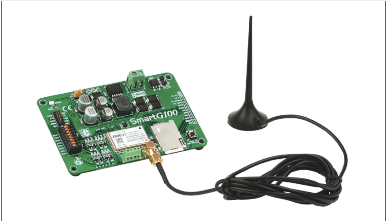
Figure 1: SmartG100 with uBlox Leon-G100 module