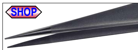
Strong Tweezers Tapered To Point