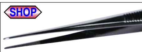
Long Tapered to Fine Tip Serrated