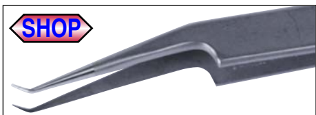
Fine Points Angled with 40° - Tip Bend