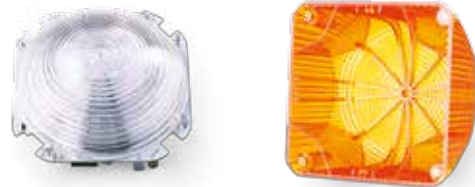
Internal diffuser and special lens pattern for optimal 360° signalling effect