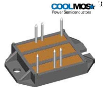
Pin arrangement see outlines