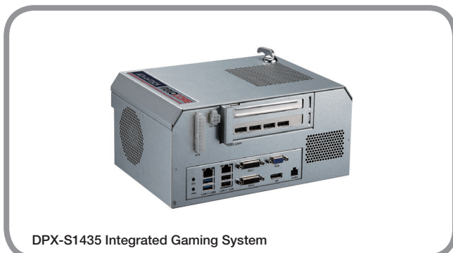
DPX-S1435 Integrated Gaming System